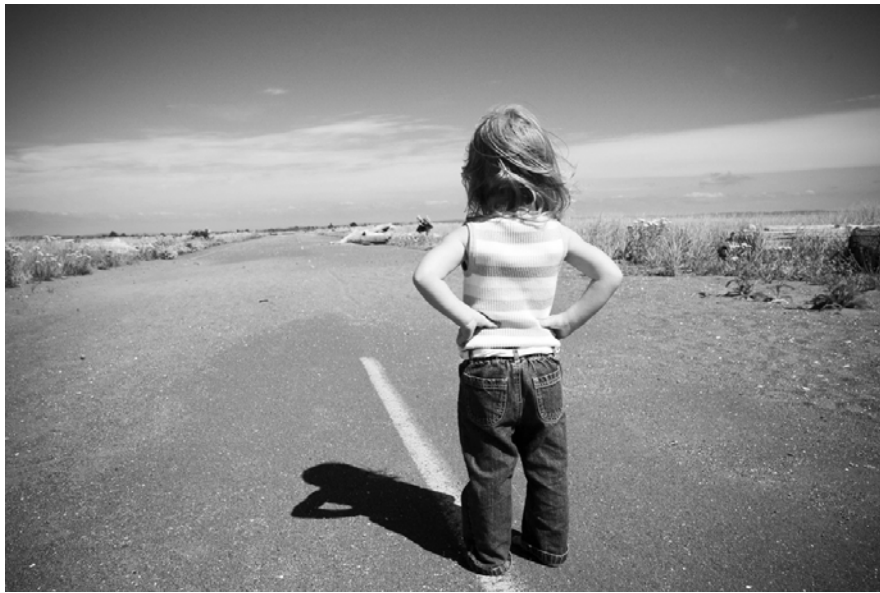
Kids should not feel alone on the never ending journey of learning...